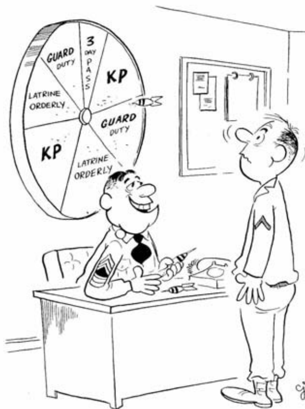
"Rumor has it that you'd gamble on almost anything, Henderson."